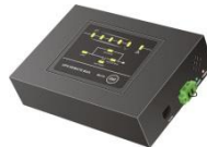
Remote Panel For 6/10kVA P/RT and T Datasheet: Link Item No.: 10120570