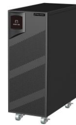
Battery Pack with 2x Battery Sets inside (Each battery set contain 20x 12V/7Ah batteries) Datasheet: Link Item No.: